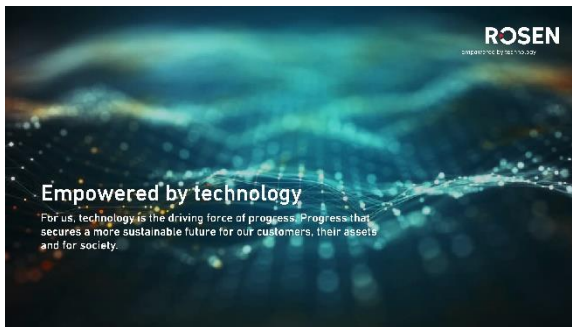
Caption: Screenshot of ROSEN's new website.